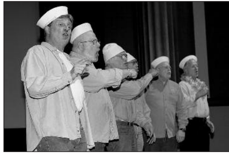
“There is nothin’ like a dame...” with singers from the Mayflower Chorus

In honor of MLP’s 25 years of achievement, the event attracted a number of sponsors, making it the most successful fundraiser in